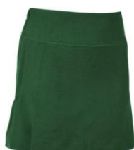
Harlin Skort Y04 - LGE