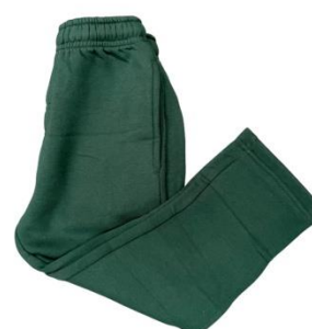
Trackpant - No Cuff Y02 -Y14