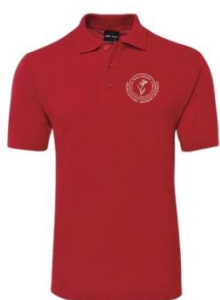
School Polo Y02 - LGE

Nollamara Primary has a school uniform of red and green. All uniform items are available to purchase through Tudor Uniforms. Parents can order online by visiting Tudors website and creating an account. Alternatively, you can visit their showroom at 1/75 Excellence Drive Wangara. Opening hours are Monday – Friday 8am – 4:30pm.