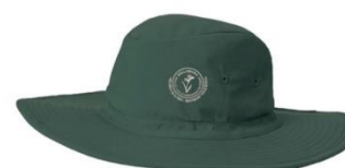
School Hat S,M,L