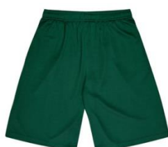
Driwear Shorts Y04 -Y14