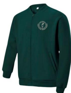
Fleece Zip Jacket Y02 - Y16